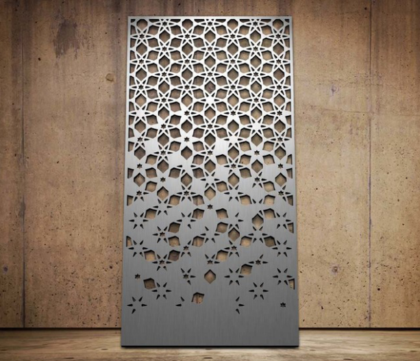
Image 1: http://www.paneltime.com.au/wp-content/uploads/2016/06/31.jpg

Image 2: https://s-media-cache-ak0.pinimg.com/originals/19/bc/67/19bc67eb07312fd5023103ff04ed22a9.jpg