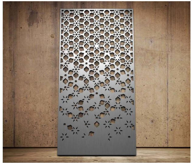
Image 1: http://www.paneltime.com.au/wp-content/uploads/2016/06/31.jpg